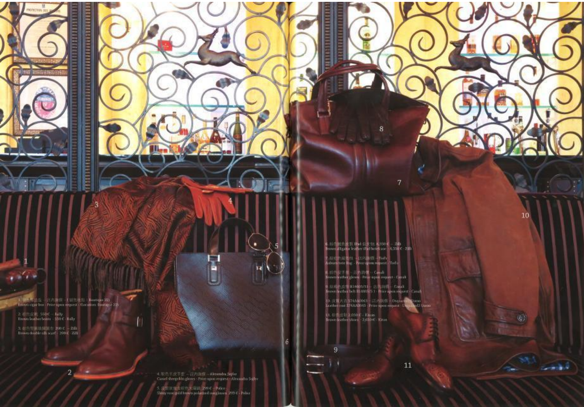
1. 棕色牛皮包 - 意大利品牌 - (品牌地址) Boutique 300 Brown cognac bag - Price upon request - Location: Boutique 300